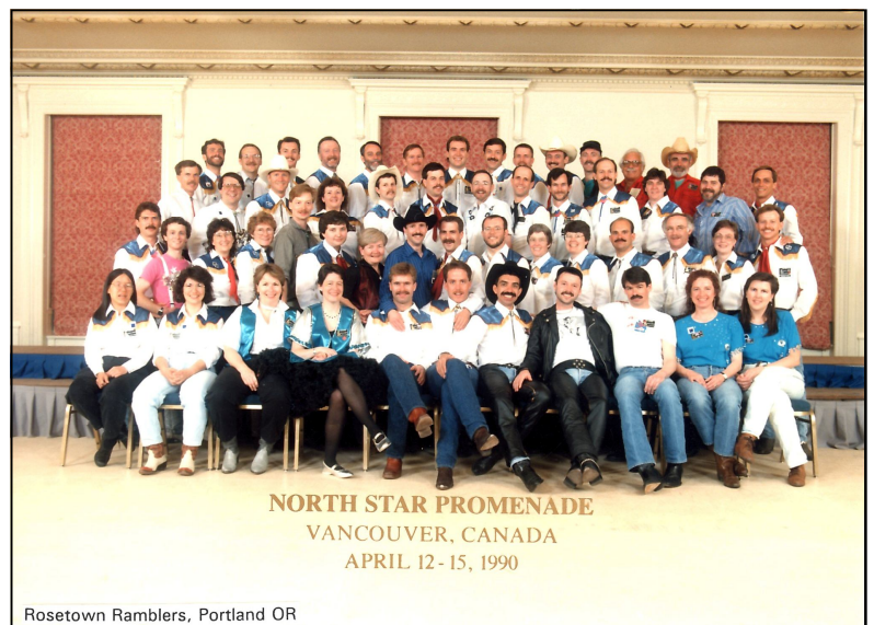
Rosetown Ramblers, Portland OR