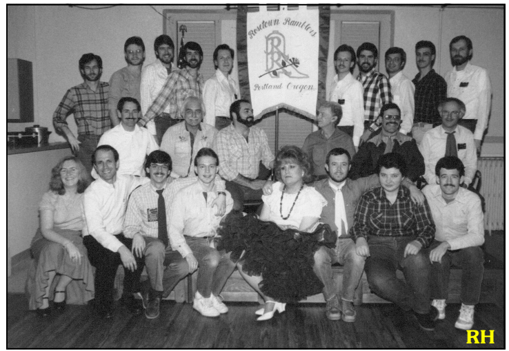
Ramblers - 1987

In the fall of 2013 the Rosetown Ramblers will celebrate 30 years of learning, dancing and enjoying “friendship set to music.” In that time hundreds of dancers have come and gone, and there’s always an empty spot for more.